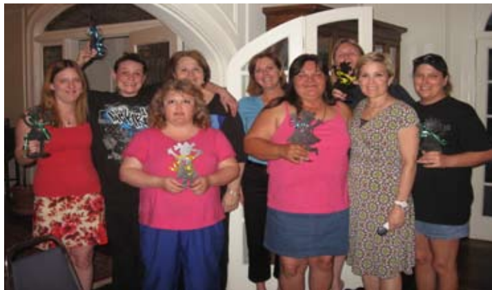
Spring 2009 Drug Court graduates and counselors.