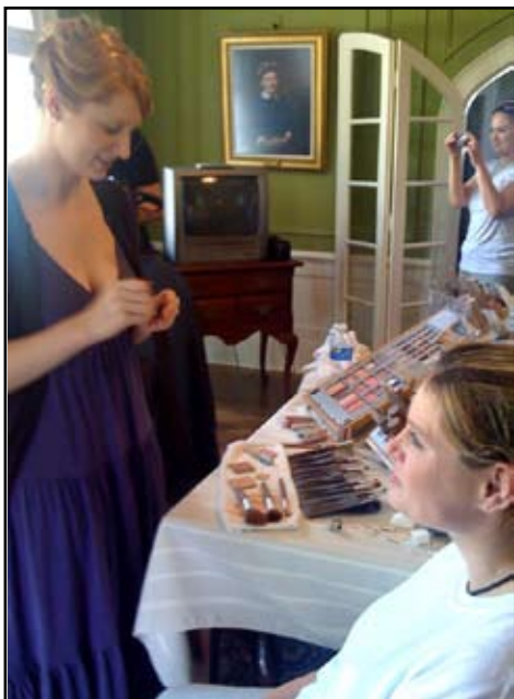
Tulsa Junior League treated Resonance Clients to a "Diva Day" event

*These donors have notified us that they have included Resonance Center for Women in their giving plans through wills, trusts, estates, or charitable gift annuities.